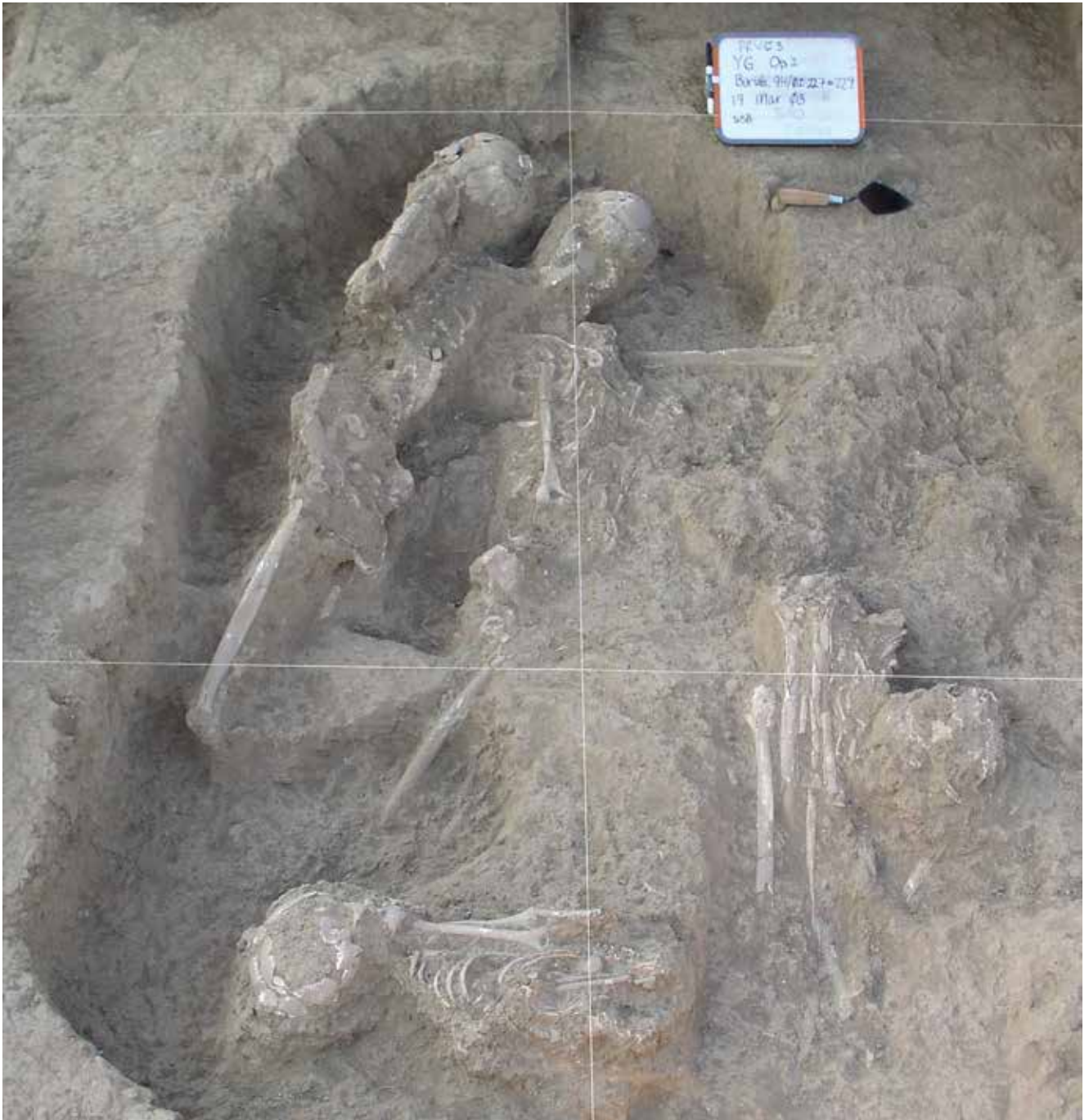
Human burials (above) were the most significant ensouling rituals. This flute made of bone (below) was found at an elite burial in Yuguë.