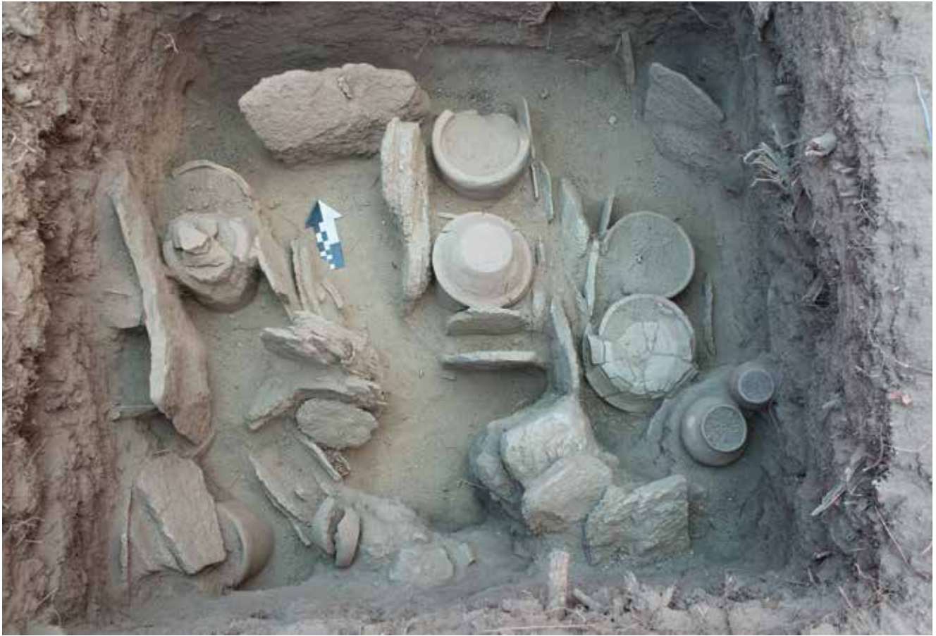
An offering of ceramic vessels in granite-slab compartments was discovered at Cerro de la Virgen.

ritual spaces in their villages. By the Late Formative Period (400-150 B.C.), the site had grown to a population estimated to be as high as 20,000 people.