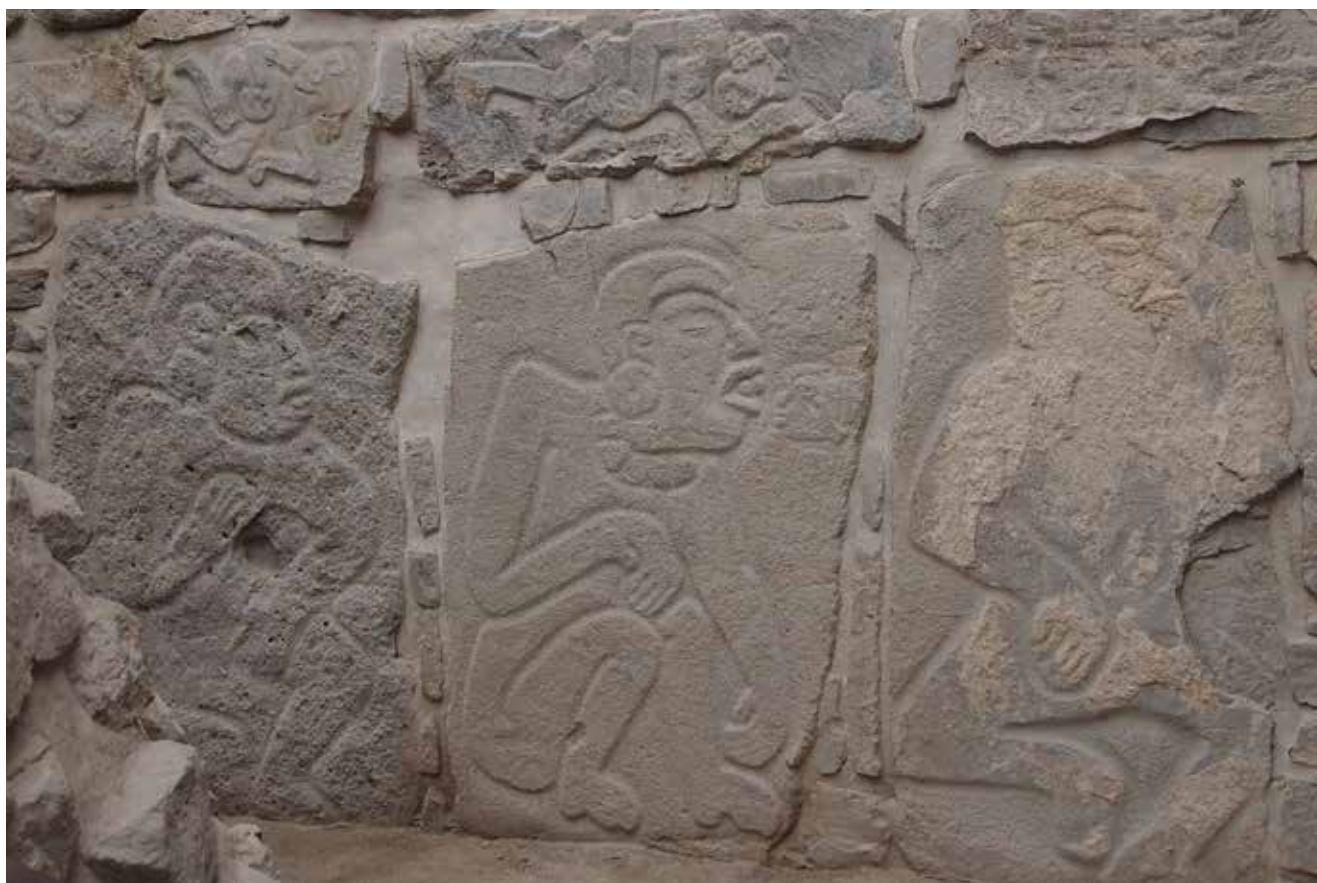
Carved stone slabs from a building on Monte Albán's Main Plaza show people performing autosacrifice and invoking their ancestors.